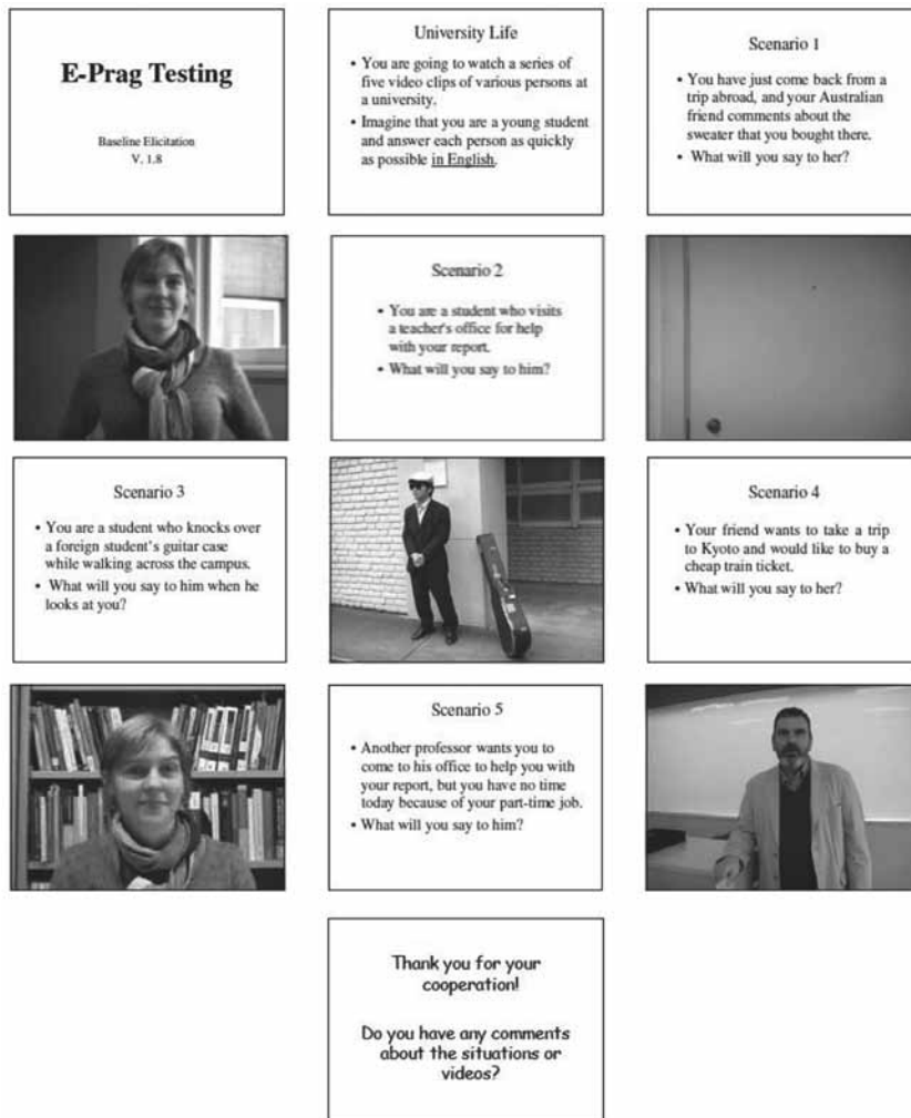
Figure 1. PowerPoint slide show used to pilot the videos and scenarios

A role-play format was adopted since this is a common means for practicing as well as testing the acquisition of speech acts and also because role plays "have the advantage over authentic conversation that they are replicable...." (Kasper & Dahl, 1991, p. 20), an important quality for a classroom-based test of interlanguage pragmatics. Although there may be some question about the authenticity of this semi-role-play format, Kasper and Rose (2002) suggest that role plays can be used because "inauthentic" does not necessarily mean "invalid" (p. 80). In the case of this test the format has the advantage of assuring that all test takers receive the same input, something that is uncontrollable in truly authentic data.