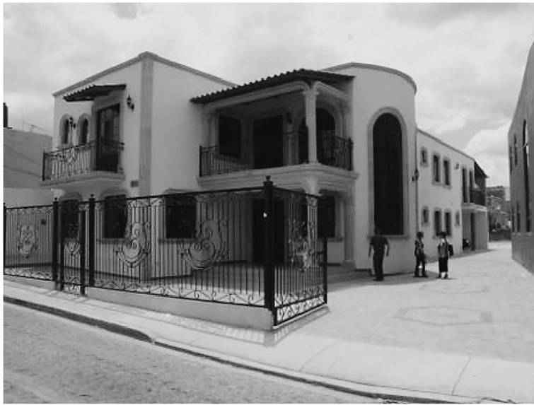
Figure 2. Partial Rustico-type residence.

The residences of many immigrants imitate Rustico , a characteristic design mode that promotes nostalgia for tradition. Most of these residences are haciendas and traditional houses in the centro that were created in recent years based on a reproduction of Spanish aesthetics from building made in the US. These designs, which conjure a sense of nostalgia, have been partially incorporated into internal and external spaces—such as windows, pillars, and walls—and are not used in unified ways throughout the buildings (Figure 2). For example, they might clash with individual features, such as ceiling finishing that shows the beams, adobe walls, masonry fitting frames, and mesquite doors.