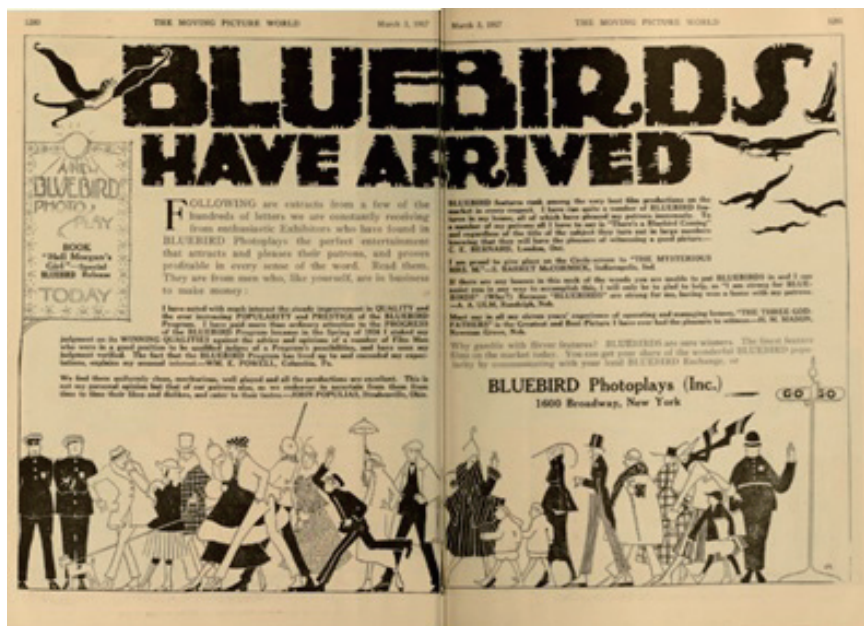
Figure 1: The advertisement of Bluebird ( Moving Picture World , 3 March 1916)

Movie fan culture as another facet catering mainly to female audiences emerged during this period. Fan magazines, like Motion Picture Story Magazine (first published in 1911) and Photoplay (in 1912), started to be published in the early 1910's. At the same time, promotional items began to be sold in the movie theatres. For instance, pictures of the actors, their calendars, or even spoons embossed with the likeness of picture players were sold. (21) This fan culture was mainly supported by female audiences. (22) The increase of female moviegoers encouraged a change in the image of movies from the cheap and obscure amusement to the healthy mass entertainment favorable for every kind of American citizens.