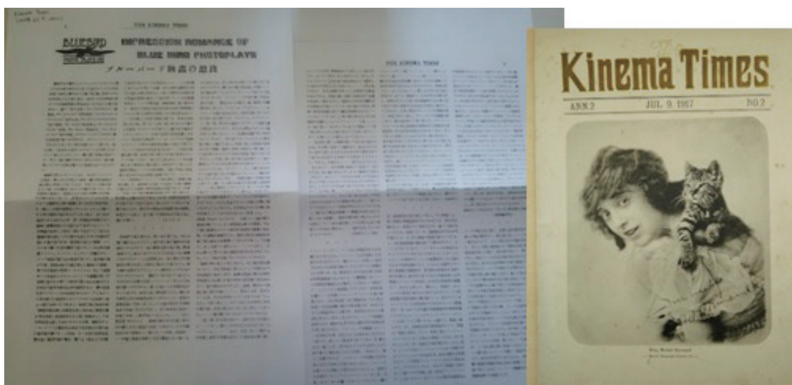
Figure 2: The feature article (left) and the cover (right) of The Kinema Times (9 July 1917)