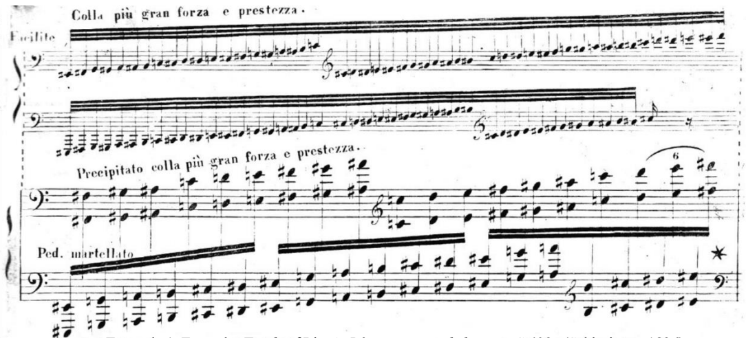
Example 1: From the Finale of Liszt's Réminiscences de la juive, S.409a (Schlesinger, 1836)

This is a description of blind octaves (octaves rapidly alternating between the two hands), which first appeared in the Finale of Liszt's Réminiscences de la juive , based on Halévy's opera of that name and composed in 1835 (see Example 1). It is interesting to note that within a few years, the technique was being widely adopted by others in their own music.